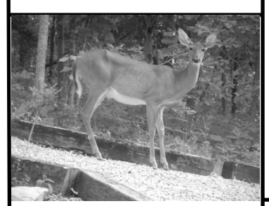
Enjoy the deer just passing thru